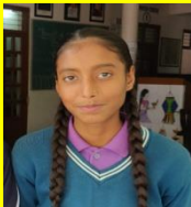
Isha State Level Participation in U-19 Badminton