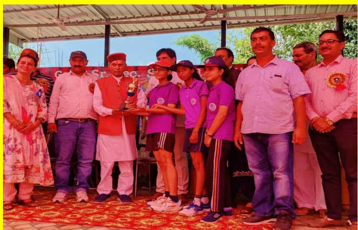
Gold Medal Distt,Level Badminton (U-19)