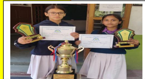
Distt. Level Winner in CSC(ScienceQuiz)