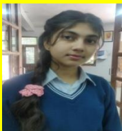
Nandini Distt.Level Participation in U-19 Badminton